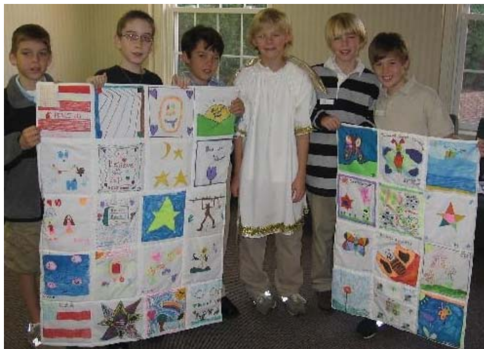
Children across the campuses used fabric paint to decorate squares for quilts. Adults sewed together the squares and quilted. The quilts were given to soliders, a sick child, and other people in need of comfort and love. Children were told something about the likes and interests of the quilts' recipients in order to create something special.