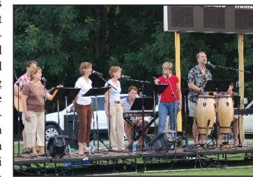
Members of Westminster's Worship Band at last year's summer concert.

Don't miss this year's Worship Band Concert that will be held Saturday night at Grimsley High School Auditorium. The concert will feature band members from both