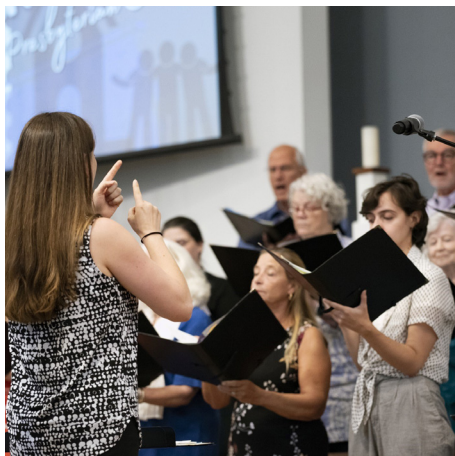
WORSHIP & MUSIC