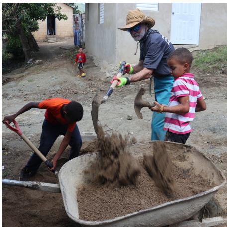
OUTREACH & MISSION