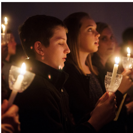
CARE & FELLOWSHIP